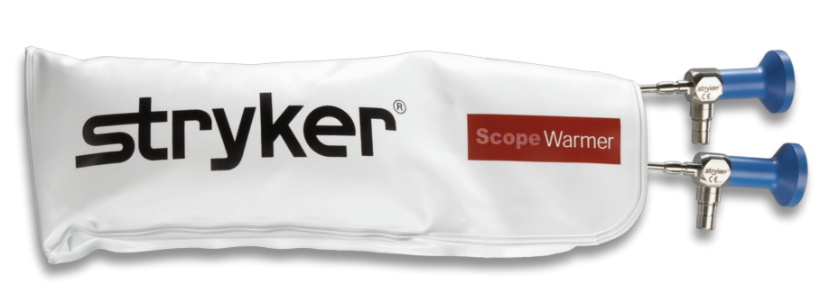
Scope Warmer 502-360-000 (Box of 6)

Stryker's Scope Warmer is activated without the need for electrical connections or messy saline solutions.